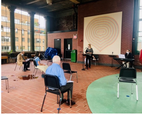
Morning Prayer in session.