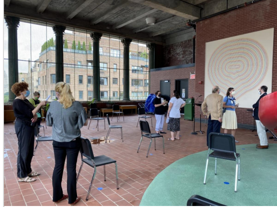
Mingling and social distancing.

We have shared with you photos of the completed ramp renovation, and now we want to show you what it is like to enter the church via the ramp. Click on the link below for a video and see the vast improvement.