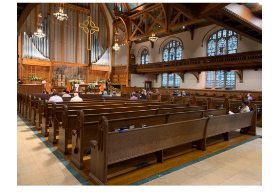
Easter Sunday Morning Prayer in the Sanctuary at MAPC.