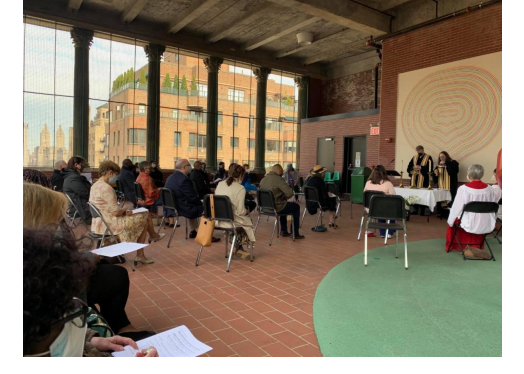
Service of Communion on the Roof on Easter Sunday at MAPC.