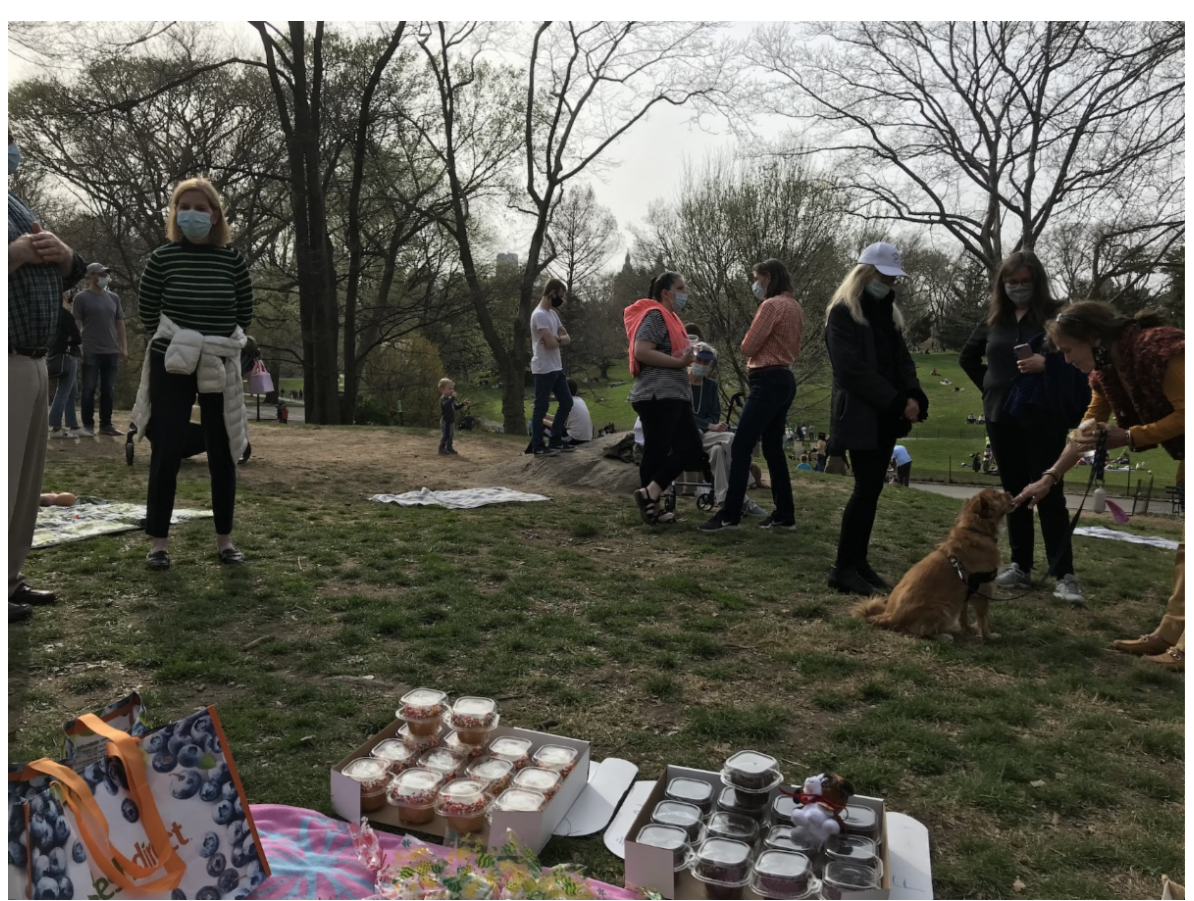
We had a wonderful Easter Fest at Cedar Hill in Central Park last Saturday with an intergenerational gathering of MAPC members from age 1 to 85!