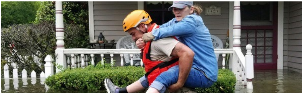
A Texas National Guardsman carries a resident from her flooded home following Hurricane Harvey in Houston.

The destruction from recent hurricanes has been widely published and work has begun to help people recover. Residents of Texas, Florida, Louisiana, Puerto Rico, Barbuda, the Virgin Islands, Cuba, and elsewhere will be impacted for years to come. Many are still trying to meet immediate and basic human needs. Fires in the Western United States have destroyed homes and displaced many. Natural disasters continue to affect people throughout the world—including famine in South Sudan. Please pray for those affected.