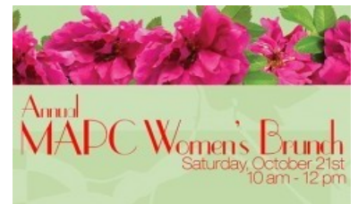
Annual Women’s Brunch