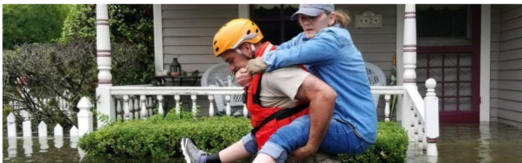
A Texas National Guardsman carries a resident from her flooded home following Hurricane Harvey in Houston.

The destruction from recent hurricanes has been widely published and work has begun to help people recover. Residents of Texas, Florida, Louisiana, Puerto Rico, Barbuda, the Virgin Islands, Cuba, and elsewhere will be impacted for years to come. Many are still trying to meet immediate and basic human needs. Fires in the Western United States have destroyed homes and displaced many. Natural disasters continue to affect people throughout our world—including famine in South Sudan. Please pray for those affected.