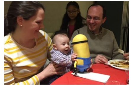
Families enjoying Church Family Night.

Come kick off the fall with a fun night of fellowship! We'll enjoy dinner, complete with both child and adult beverages, a craft activity, a movie (with popcorn), and play in the gym and on the Roof Garden. Come spend time with church friends you may not have seen over the summer months. You do not need to have children at home to come to Church Family Night—it is for the whole church family (however, you do need to be comfortable with a bit of happy chaos!). Suggested donation for the evening is $20 for adults, and a contribution of your choice for children under 12. RSVP to Lissette Perez-Erazo in the church offices, lgp@mapc.com .