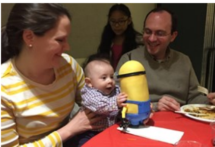
Families enjoying Church Family Night.

Yes, it's already time for Church Family Night! Come have dinner, come enjoy a craft activity, a movie (with popcorn), and play in the gym or on the Roof Garden. It's a great time to catch up with church friends you haven't seen over the summer or meet some new ones! You do not need to have children at home to come to Church Family Night—it is for the whole church family (however, you do need to be comfortable with some noisy kinetic energy!). Suggested donation for the evening is $20 for adults, and a contribution of your choice for children under 12. Chef Jim needs to know how many to cook for, so please let Lissette Perez-Erazo know if you are coming, lgp@mapc.com .