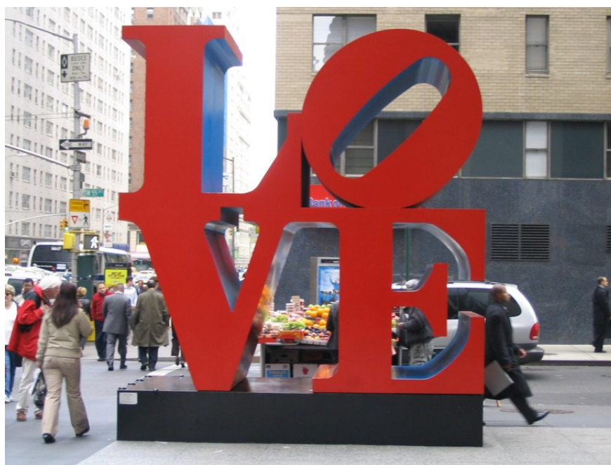
“Love,” sculpture by Robert Indiana, 1970. W. 55th St. & 6th Avenue, New York.